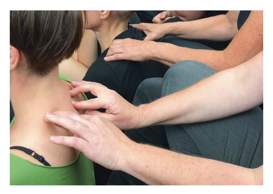
Fig. 6.1 Care at Reclaim Pride.

celebrations, started feminist cafés, consciousness-raising groups and so much more. I am simultaneously both proud and ashamed. Proud for what I have done and even more for what some of my friends have done. Ashamed that I stopped being an activist. I got married. I had a child. I lived the ultimate heteronormative life, except it was with another lesbian. But still. I struggle with myself and my feelings of belonging and disbelonging, of pride and shame. I also observe how, due to my own feelings of insecurity, I risk being exclusionary myself as soon as I feel safe with my crew. How I greet high-status members of the queer community with extra warmth; how confident I am that I know some of them, can even hug some of them. Ashamed again. What am I doing? What am I trying to prove? And to whom? I guess it is a way to make myself feel that I do belong even though I spend most of my time at the university and with my family.