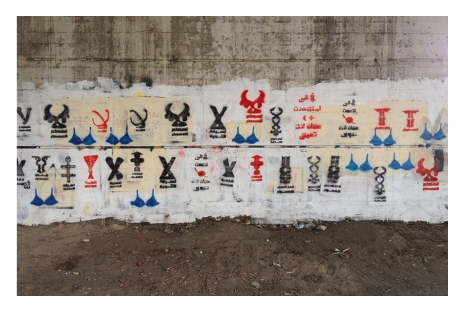
Fig. 3.3 Elements from the 'No' campaign. Stencils and photograph: Bahia Shehab. Courtesy of the artist

others, the blue bra) and the words of Pablo Neruda: 'You can cut all the flowers but you cannot keep Spring from coming' (Fig. 3.3).