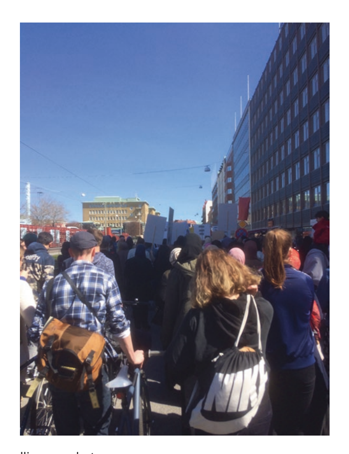
Fig. 4.2 The allies come last

who wants to contribute [...]. Also this, to perceive that we have many persons around us, with whom we both work and cooperate and who we have in our everyday life, who in different ways identify themselves as antiracist and who are anti-racists. And here, you have a possibility to join in something you will not necessarily get cred for, but it is the principle that you are with. [I] think it was something like that.