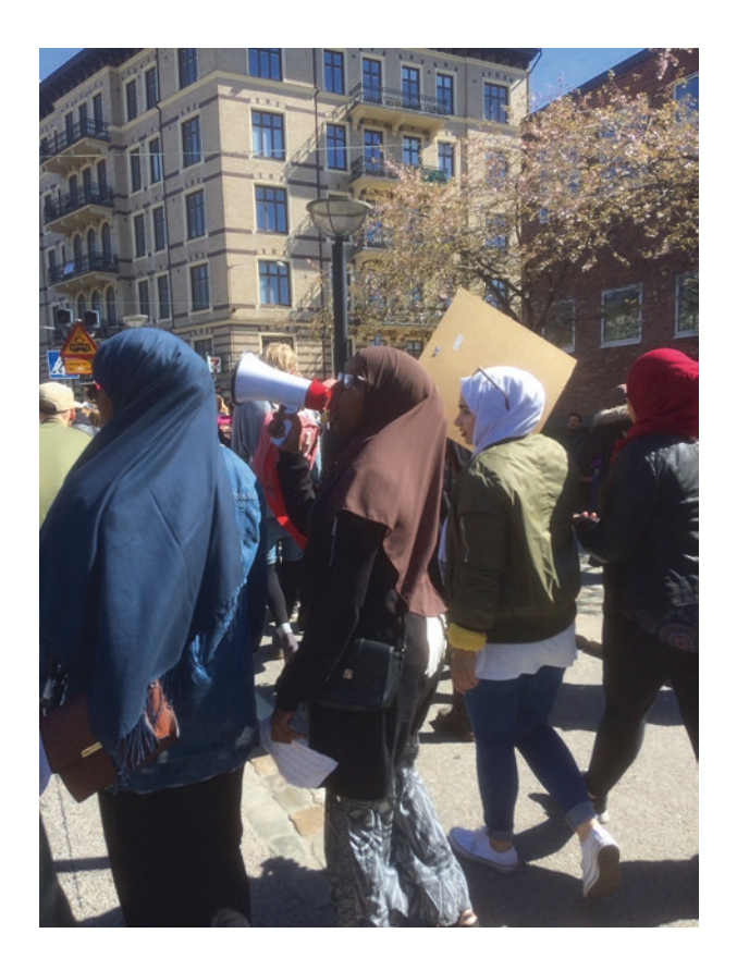
Fig. 4.1 Young woman with a megaphone

hand to hand. This picture and practice challenged notions of the oppressed Muslim woman in need of help (Abu-Lughod 2013). The voices on the march were strong ones, and the echoes among the buildings increased their effects. Two times after each other, they called out (Fig. 4.1):