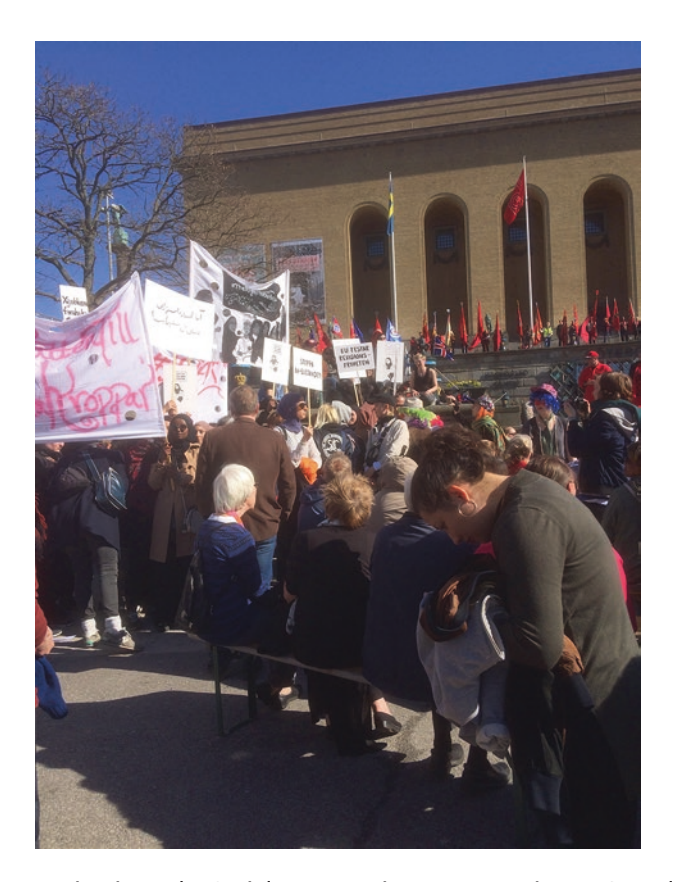
Fig. 4.4 Intervention in to the Social Democratic party's meeting at Götaplatsen

I took pictures with my phone, and when Abdullahi and I looked at them several months later, she tried hard to remember the details of what had happened. She recalled that she had felt a bit embarrassed standing there in silence. I remembered that I had been quite affected by this very performative intervention into a hegemonic social order normalised to act and dress in certain ways. I had understood it as an interpellation to the governing party to act and recognise also these women. Through their political act, they raised a number of questions: Who counted as workers in the Swedish workers' movement? Which women should receive possibilities for gender equality? Who counted as Swedes for whose rights the