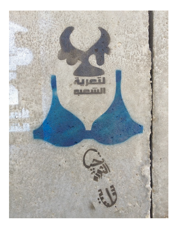
Fig. 3.2 'No to stripping...' Stencil and photograph: Bahia Shehab. Courtesy of the artist

The latter is one of the more famous pieces in the series, originally commenting on a notable incident in which a veiled protesting woman was violently stripped and beaten by military men. The incident was filmed and circulated on the internet, and international broadcasters such as CNN and the National Post covered the story of the beaten young woman. The media images show three policemen dragging the woman's unconscious body: her hijab and long black abaya ripped off, exposing her stomach and her blue bra. Shehab's artistic comment consists of a stencil of a blue bra and a bootprint representing the military that reads 'Long live a peaceful revolution'. In her TED talk, Shehab says it represents a 'reminder of the shame' of Egypt for allowing such actions and that 'we will never retaliate with violence'. The blue bra quickly became a cultural product itself and a symbol of the protests after the Egyptian