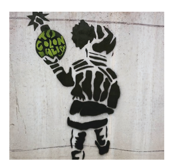
Fig. 3.1 'To colonialism'. Stencil and photograph: Anders Sunna.

The focus on street art partly implies a centring of visual expression, which necessarily excludes other ways of communicating and experiencing protest (e.g., written, spoken or sung communication, physical pain, emotional reactions). We draw here upon Lisiak (2015: 4), who concludes that: 'analysis of revolutionary iconography is important because it is [...] protesters' lingua franca' (see also Buck-Morss 2002). However, the delimitation to visual expressions still offers a variety of possible perspectives. We start by briefly delving into the analytical possibilities opened up by relating the studied expressions to the associations, practices and aesthetics associated with street art.